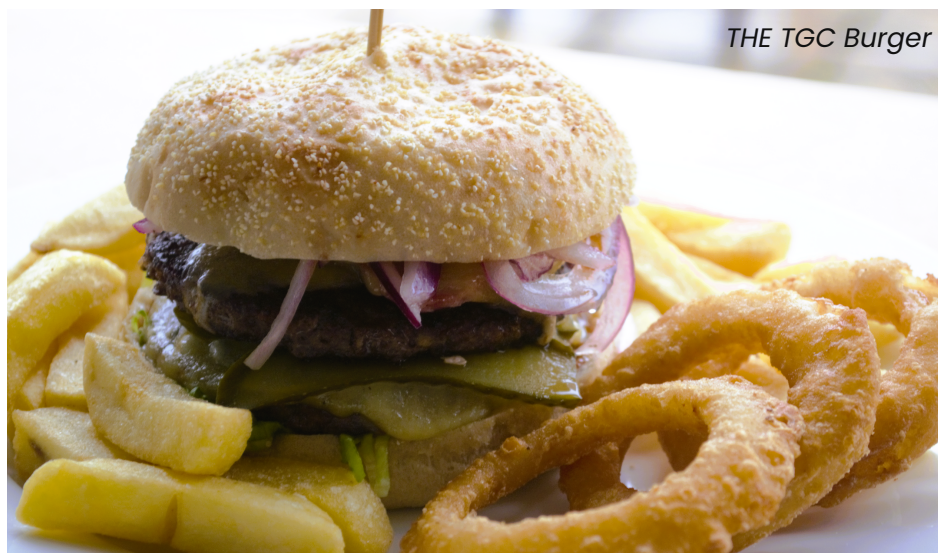
THE TGC Burger

THE TGC Burger £12.95 2 x 4oz beef patties, melted cheese, bbq sauce, gherkins, bacon, red onion & lettuce